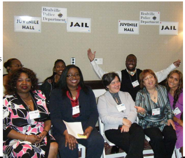
Participants are sent to jail or juvenile hall for various offenses.