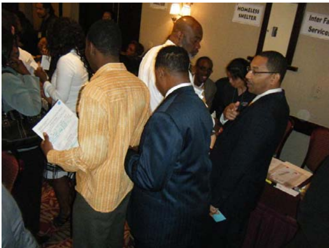
Participants stand in long lines for various community resources and services.