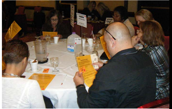
Participants receive and read their instructions.