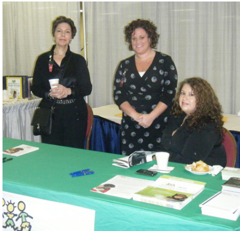
The Quality Counts booth at the ELC Curricula Conference

Teachers enjoy the break-out sessions at the ELC Curricula Conference