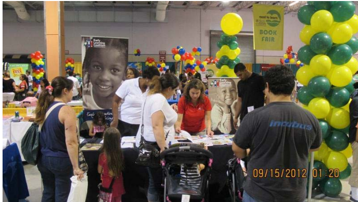
Early Learning Coalition staff distributing information to parents at The Children's Trust Family Expo.

The Children's Trust held its annual Family Expo on Saturday, Sept. 15. The event drew thousands of families to the Miami-Dade County Fair and Expo Center to learn about community resources available to them. Children received free books and parents were encouraged to register for the Read to Learn Book Club. Visitors also had the chance to pick up recipe cards, take home fresh produce and participate in physical activities.