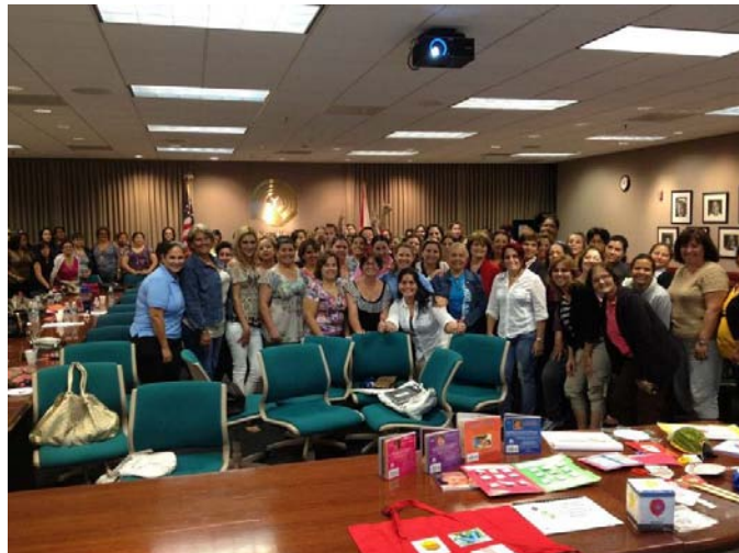
The Spanish session held at the United Way was attended by 82 providers.