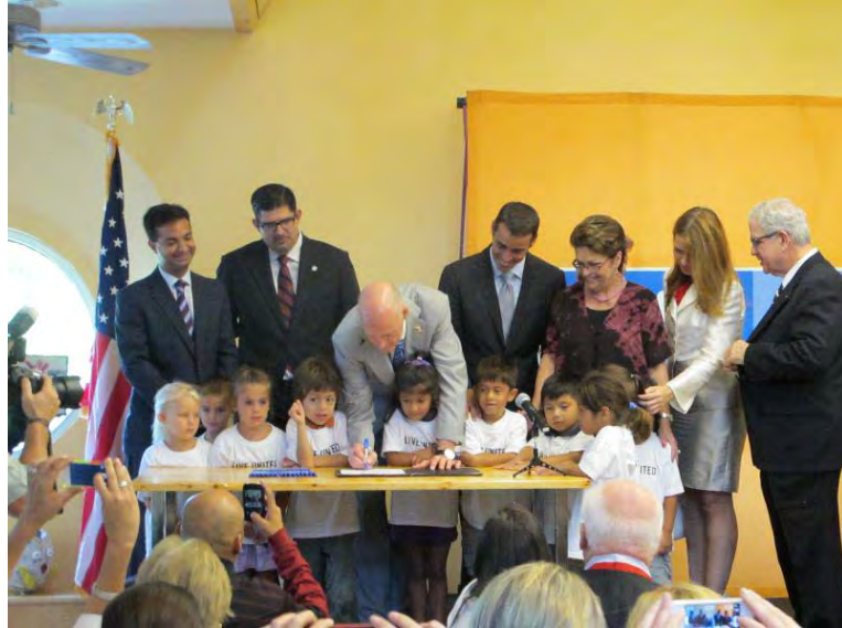
Governor Scott signs HB7165 surrounded by early learning leaders and children from the United Way Center for Excellence in Early Education.

Governor Scott said, "This bill will prioritize early learning education by moving many of its functions into the Department of Education, which will increase accountability and transparency for early learning programs."