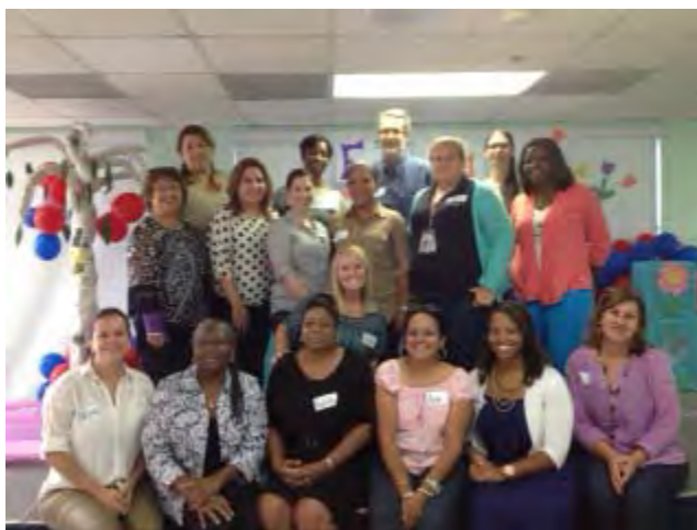
Trainers participated in a two-day Train-the-Trainer series.

The first ELC 'train the trainer' session for the National Early Care and Education Learning Collaborative brought participants together from three counties. Seventeen prospective trainers spent August 8-9 learning the fine art of peer facilitation, strategies for motivating adults to manage change and the mechanics of the Nemours 'Let's Move' Child Care curriculum.